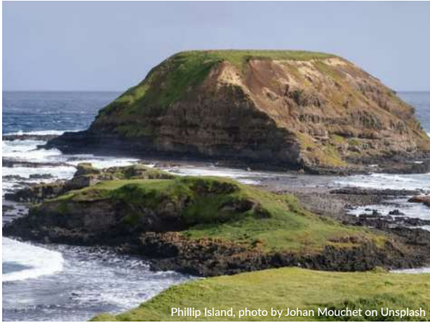
Phillip Island