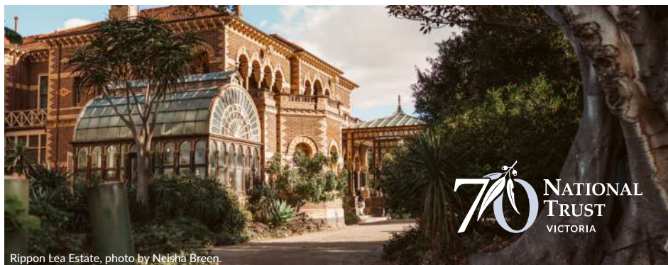
Rippon Lea Estate

The Australian Heritage Festival is an initiative of the National Trust of Australia. Except for events delivered by the National Trust of Australia (Victoria), we are not responsible for the content, quality or outcomes of registered events. Information was correct at the time of publication and is subject to change.