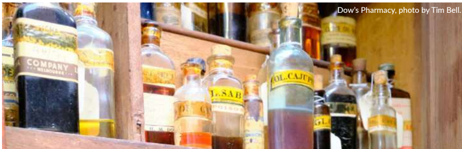
Dow's Pharmacy