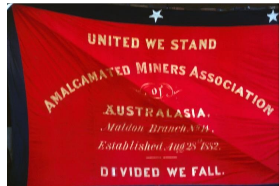
Banner of the AMAA, Maldon No. 14 Branch