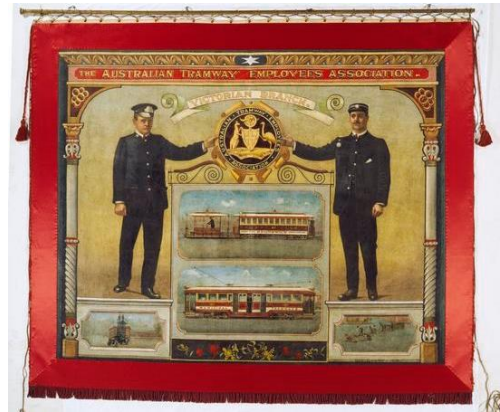
Australian Tramways Employees Association, Victorian Branch (1916)