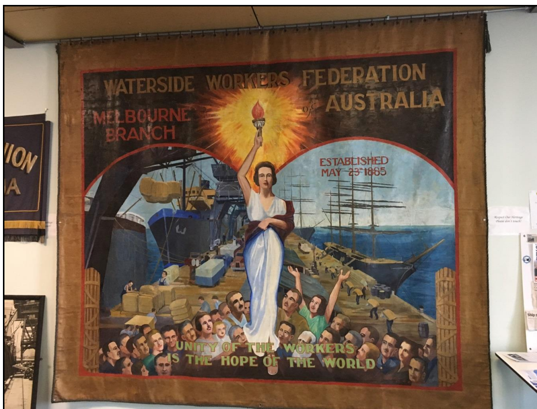
2017, Banner on display at the MUA Rooms.