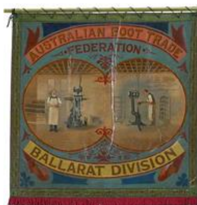
Australian Boot Trade, Ballarat Division (1905)