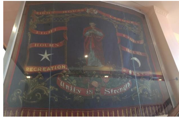
Stawell Banner within Perspex box in Stawell Town Hall.