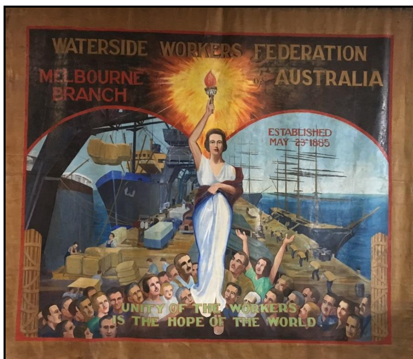
Waterside Workers Federation Banner (September 2017)