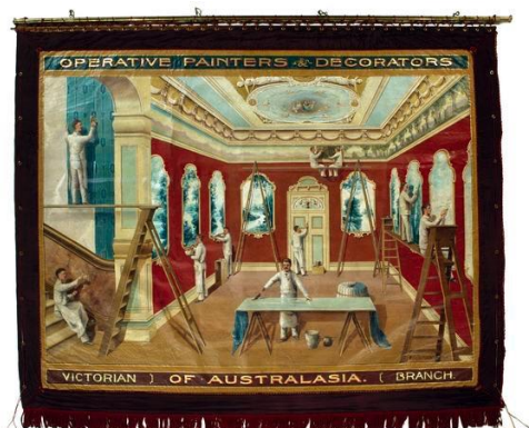
Operative Painters and Decorators Union (1915)