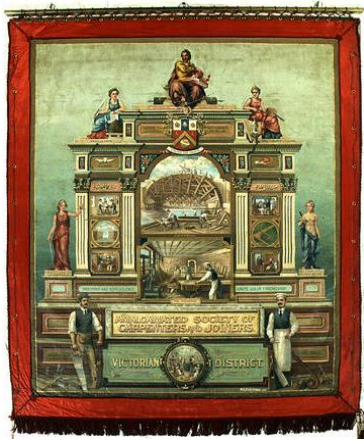
Amalgamated Society of Carpenters and Joiners, Victorian Branch, 1914