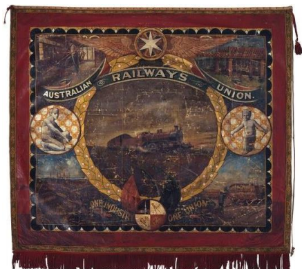
Australian Railways Union (1912)

was declared a public holiday in 1879, and renamed Labour Day in 1934. The major features of the processions were the large trade union banners, mounted and carried behind horse-drawn carriages or on floats. One side of the banner was usually a realistic depiction of the particular trade, including associated materials, tools and skills, while the other displayed allegorical figures and symbols. The Eight Hour Day Trade Union Banners are of historical and social significance for their important associations with the history of trade unionism in Victoria and with the Eight Hour Day movement. They are important historical documents which demonstrate the concerns of workers, the nature of their work and the identity of unions, as well as being powerful symbols of the role of unions in advancing conditions and wages for working people. The banners are rare surviving examples of nineteenth and early twentieth century trade union banners and represent the only substantial collection in Victoria and one of only two major Eight Hour Day banner collections in Australia.