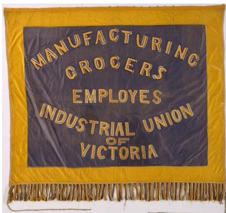
Manufacturing Grocers Employees Industrial Union of Victoria (n.d.)