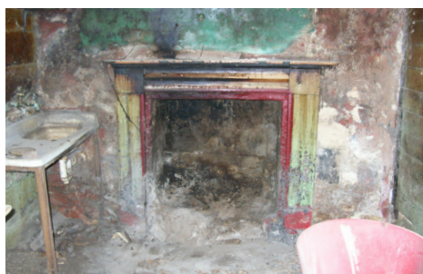
Top Kell Cottage seen through the period garden. Centre The 1840s cottage was derelict prior to renovation. Bottom The sitting room in Kell Cottage.