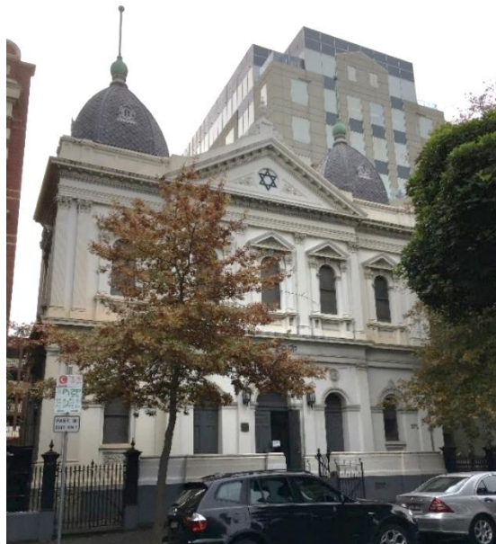
East Melbourne Synagogue (May 2018)