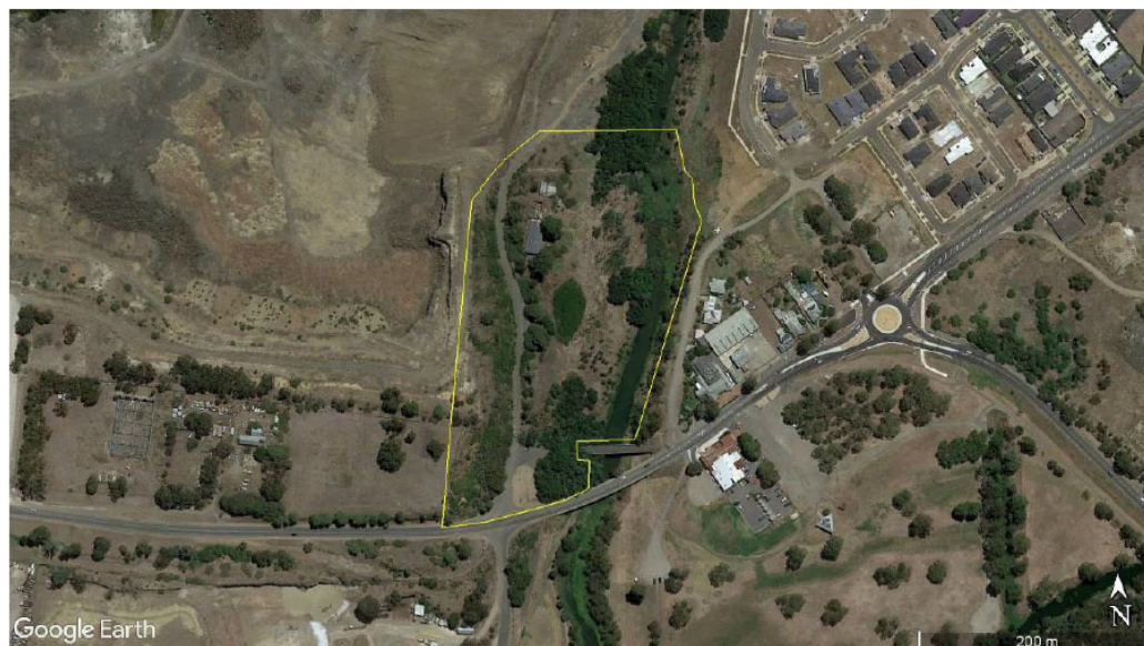
Figure 2 – Aerial photograph showing recommended extent of registration 2