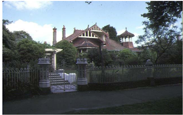
1978, Auld Reekie, from Royal Parade