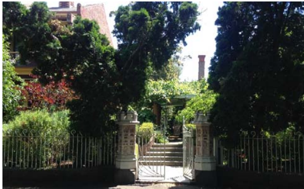
2017, Auld Reekie, from Royal Parade