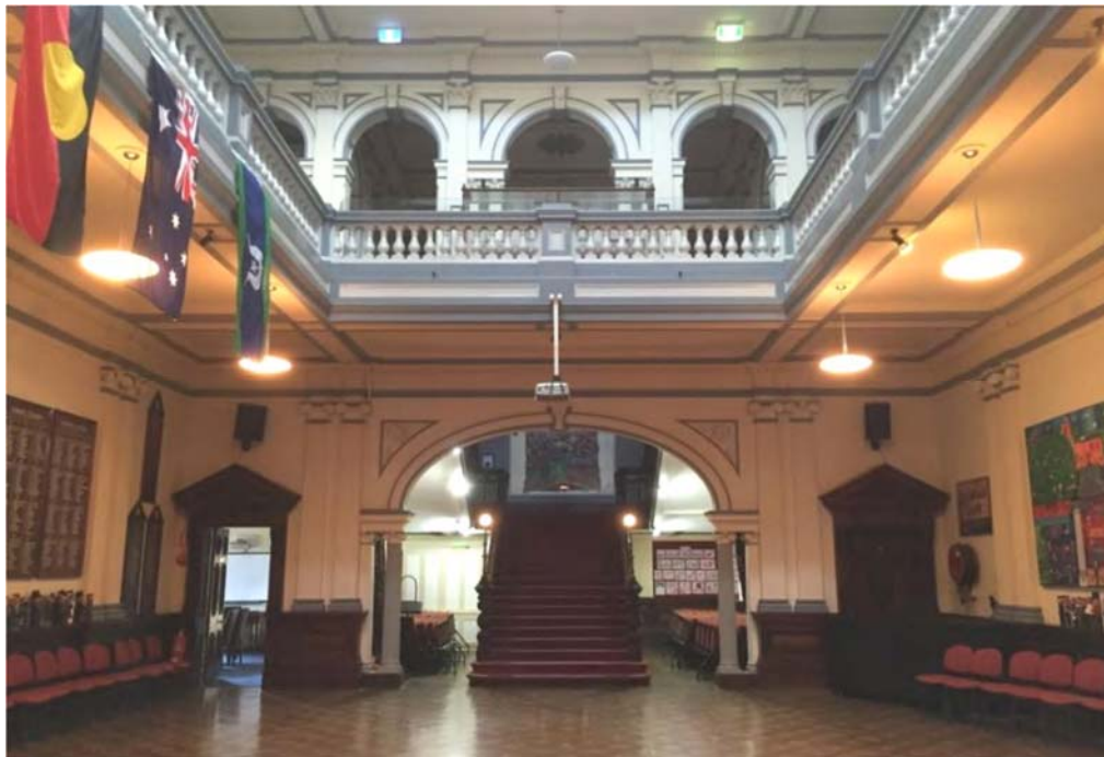
Ground-floor Main Hall and main stairs with first-floor Gallery above.