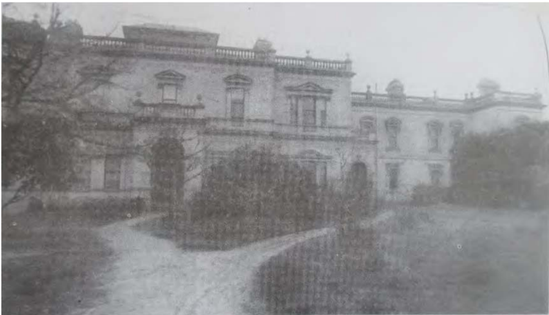
c.1924: Entrance to main school building from Willoby Avenue. Quercus canariensis is visible at left.

Name: Malvern House VHR number: VHR H0379 Hermes number: 551