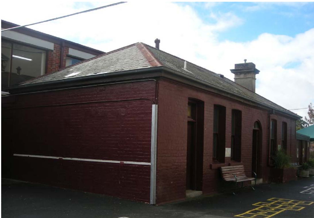
The former laundry building, now used as student changing rooms. (2017)

Name: Malvern House VHR number: VHR H0379 Hermes number: 551