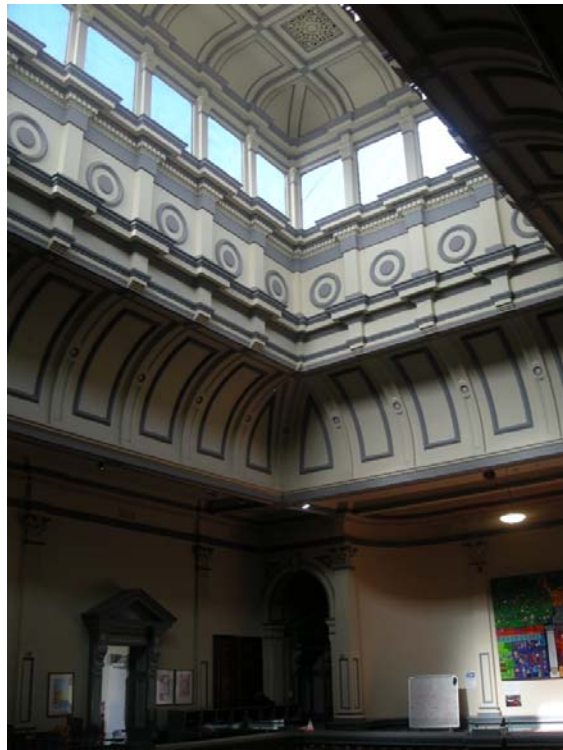
First-floor – (L) Library South, looking east; (R) Gallery with lantern above, looking south-east. (2017)