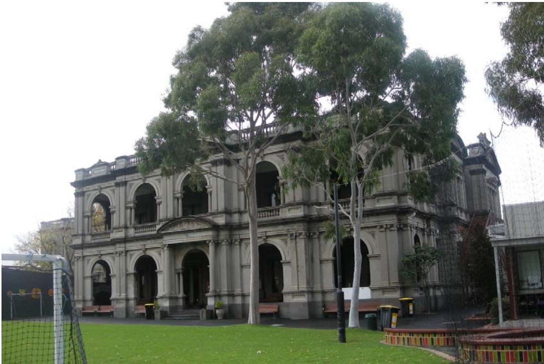
Malvern House main wing from south-west. (2017)