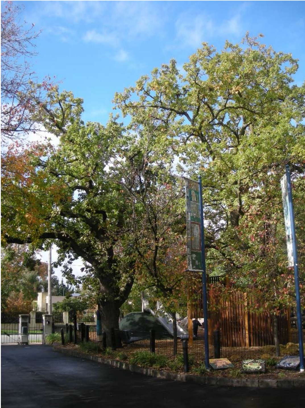
c.1900 Quercus canariensis (L) and Quercus robur (R) to the south side of the School's east (Willoby Avenue) entrance path. (2017)

Name: Malvern House VHR number: VHR H0379 Hermes number: 551