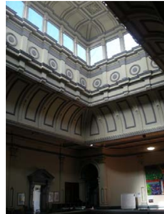
Malvern House, Glen Iris (May, 2017)