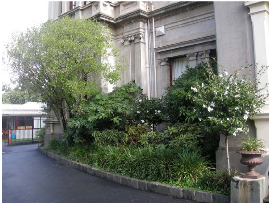
Shrub planting within garden bed area to south side of east entry steps. (2017)

Name: Malvern House VHR number: VHR H0379 Hermes number: 551