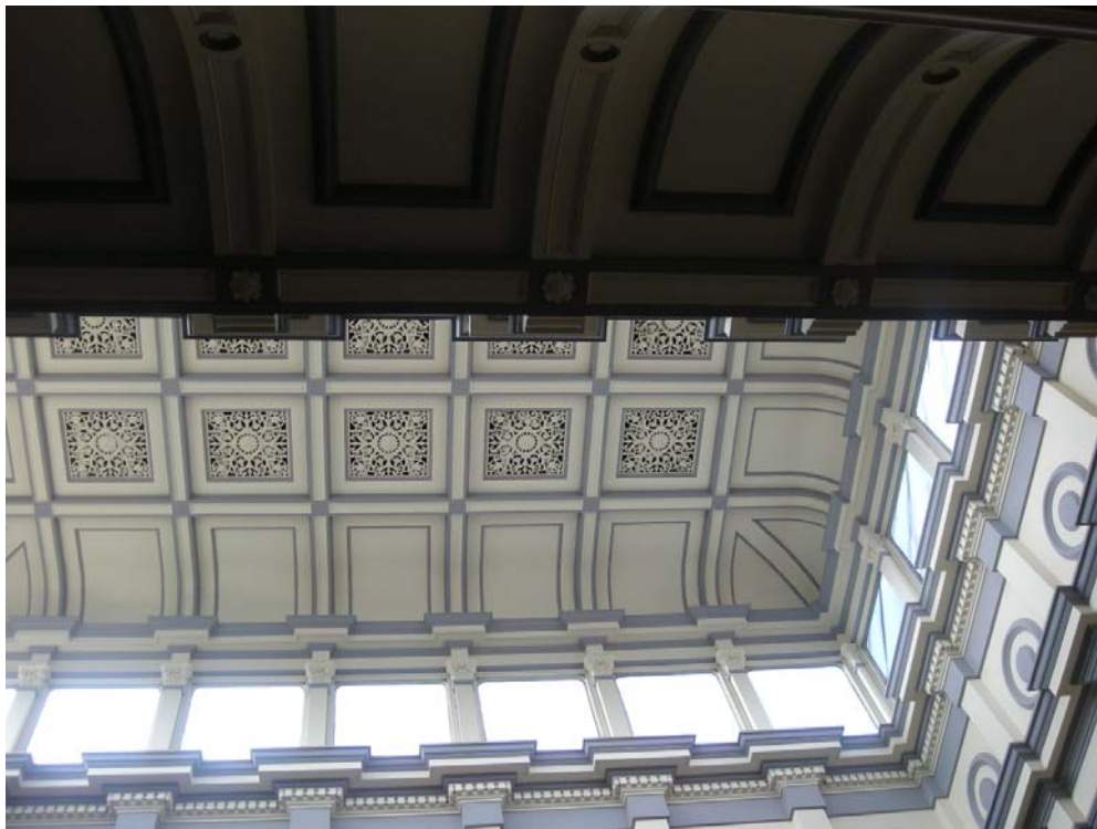
Lantern ceiling, windows and walls. (2017)

Name: Malvern House VHR number: VHR H0379 Hermes number: 551