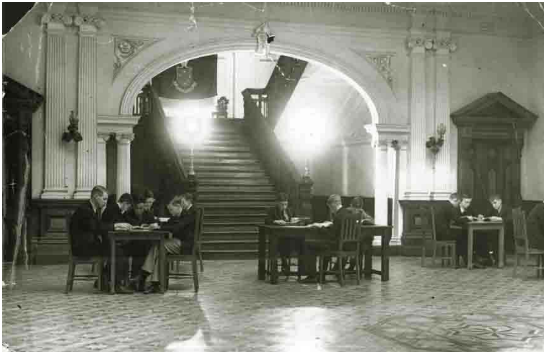
c.1930: Malvern Grammar students in the Main Hall.