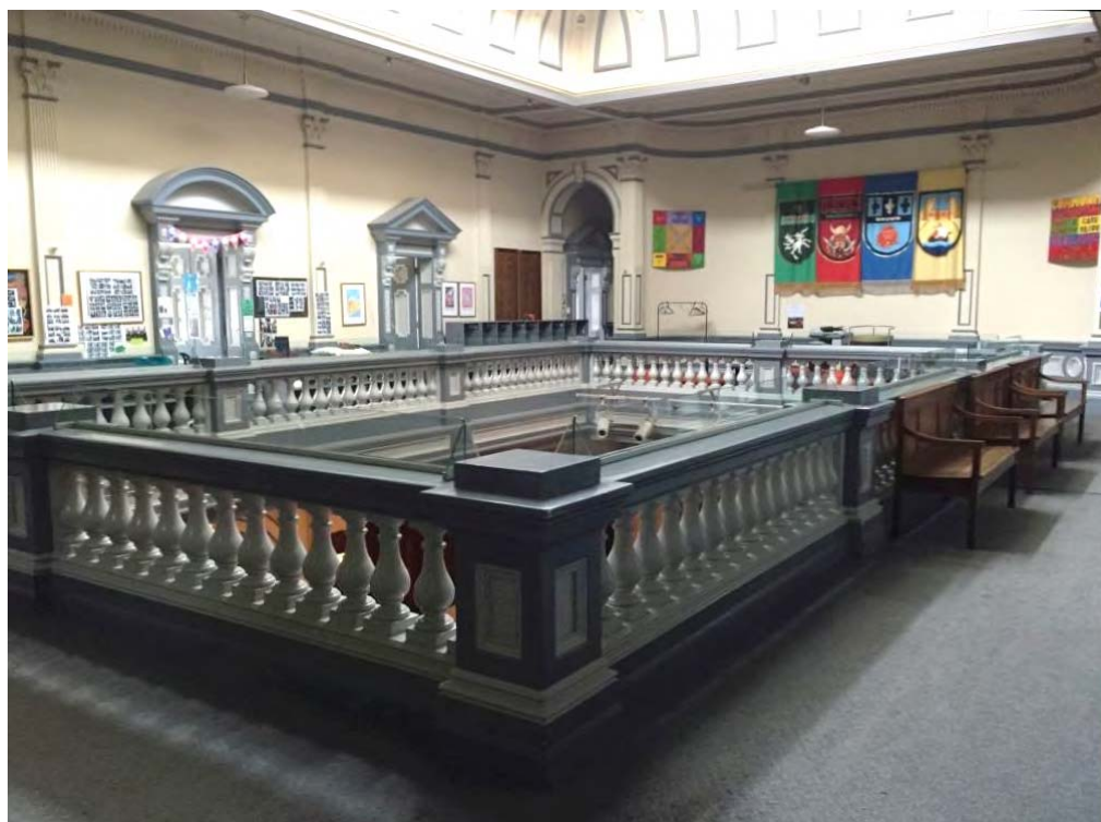
First-floor Gallery.

Name: Malvern House VHR number: VHR H0379 Hermes number: 551