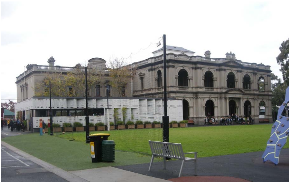
Malvern House from north-west – servants' wing on left is obscured by new demountable building, with main wing on right. Lantern roof and walls are visible above main wing's parapet. (2017)

Name: Malvern House VHR number: VHR H0379 Hermes number: 551