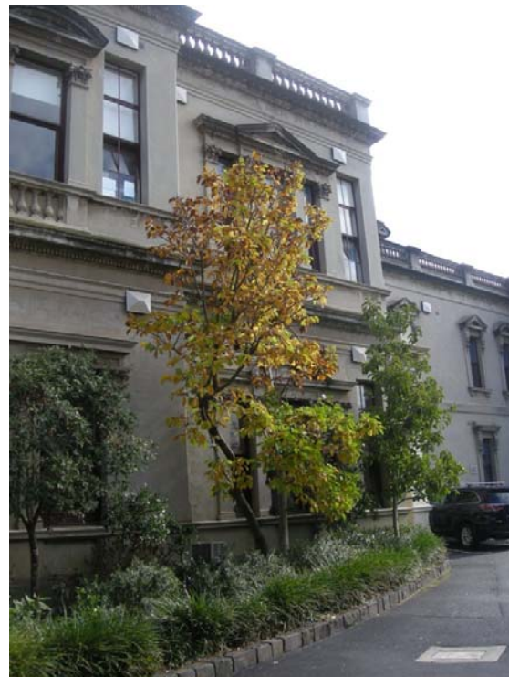
(L) Malvern House servants' wing from north-west; (R) Shrub planting within garden bed area to the north side of the main wing's east entry steps. (2017)