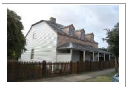
The Steampacket Hotel , Portland (VHR H0239) is significant for its potential to reveal information about interior finishes over time through the accumulations of wallpaper in the upstairs attic rooms dating from the 1850s and the linoleum laid on the floor in several rooms over various different periods.