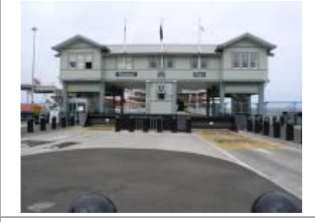
Station Pier (southern section), Port Melbourne (VHR H0985), is historically significant for its association with Australia's involvement in the World War II, both as an embarkation and arrival point for Australian troops and an embarkation point for US troops. It is also associated with the Australian Government's post-war migration program, which transformed Victoria's society in the 1950s and 1960s.