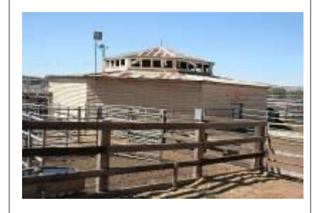
The Stock Selling Ring , Casterton (VHR H0314), is one of the few remaining examples of a stock selling ring in Victoria – a building type that was once common in Victoria.

The Shot Tower , Clifton Hill (VHR H0709), is rare as one of two surviving shot towers in Victoria. Its form reflects the shot production process: the shot was produced by dropping molten lead through sieves at the top of the tower into water at the bottom. The height of the tower allowed the shot to form before reaching the bottom.