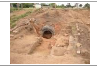
The Chinese Kiln and Market Garden , North Bendigo (VHR H2106), is the only known surviving Chinese brick kiln in Victoria and has a high potential to yield information about the processes and technology of brick manufacture and market garden operations that Chinese migrants brought to Australia in the nineteenth century.