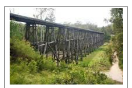
Rail Bridge over Stony Creek, Nowa Nowa (VHR H1436), is significant as a fine example of a timber trestle railway bridge, demonstrating the ingenuity and skill involved in constructing a railway line over a long distance, through difficult terrain and utilising local timber resources.