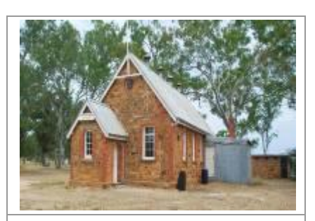
The Former Common School No. 1124, Muckleford South (VHR H1380), was built in 1871 and was an influential example for subsequent school designs. The plan, elevation and classroom layout were all typical of 'Common Schools', which were developed in the period of rural expansion following the gold rushes and the Selection Acts.