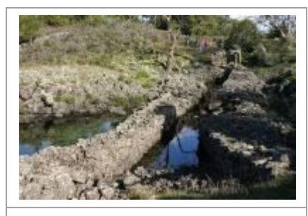
The Bessiebelle Sheepwashes and Yards , Bessiebelle (VHR H2033), are significant for their potential to inform our knowledge of large-scale mid-nineteenthcentury sheep-washing processes and technologies.

The Ellen Kelly Homestead Site , Glenrowan West (VHR H2410), is the site of the 'Fitzpatrick incident', widely regarded as the trigger event for the Kelly Outbreak. It is significant for its potential to contain archaeological evidence relating to the construction and occupation of the Kelly family dwellings and to reveal currently unavailable information regarding the Kelly family's material domestic life.