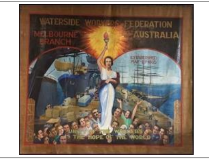
The Waterside Workers Federation Banner , Melbourne (VHR H2385), is a rare surviving union banner and a rare example of a banner produced at a time when few were being created or commissioned.