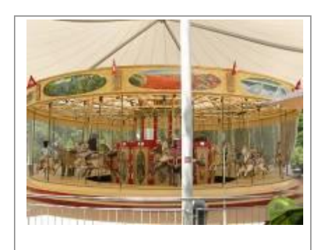
The Carousel , Royal Melbourne Zoological Gardens (VHR H1064), is significant as a rare and intact example of a nineteenth century Carousel in Victoria – fewer than 200 Carousels survive worldwide.