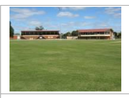
Central Park , Stawell (VHR H2284) is significant for its long and continuous association with the Stawell Athletic Club, which established the now internationally famous Stawell Gift footrace in 1878.