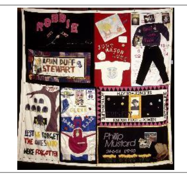
The Melbourne AIDS Memorial Quilt , Melbourne (VHR H2418), has a strong, special and continuing association with particular groups affected by the AIDS crisis and their families. Quilt panels are still accepted to commemorate people who die (or who have died) from AIDS-related conditions and the panels are also regularly exhibited around the state.