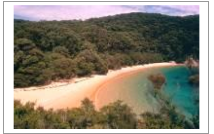
Refuge Cove , on the eastern side of Wilsons Promontory (VHR H1729), is significant for its potential to yield information relating to the bay whaling industry that operated there from 1841 and other nineteenth century activities including quarrying and timber getting.