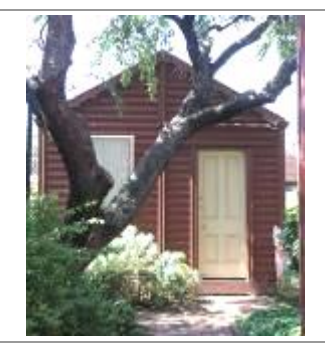
The Bellhouse Iron House , South Melbourne (VHR H1888), is significant as one of the few surviving examples of prefabricated, portable iron housing imported from England in the 1850s due to the rapid increase in population and scarcity of materials and labour during the gold rush.