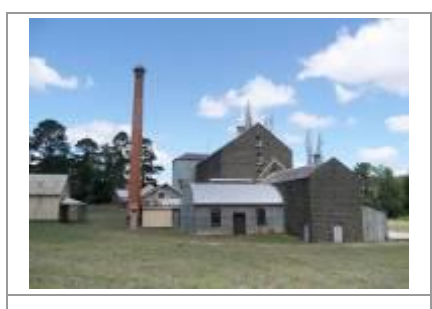
The Andersons Mill Complex , Smeaton (VHR1521), is significant as a fine and highly intact representative example of a rural industrial complex associated with the early period of wheat growing in Victoria.