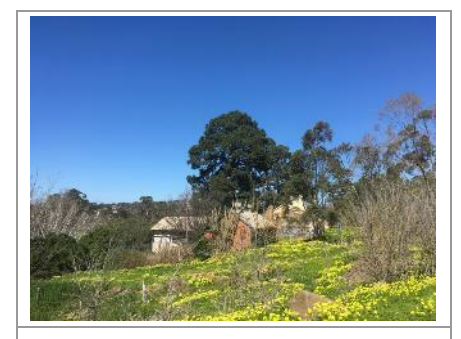
The Old Swan Inn , Fyansford (VHR H0267), is significant for its potential – both in the subsurface of the site and its standing physical fabric – to yield information about the early occupation of the Port Phillip District, early colonial buildings and their construction, gardens and landscaping, transport infrastructure and routes of movement and trade.

The Convincing Ground , Allestree (VHR H2079), was the location of one of Victoria's first whaling stations and a place of contact and conflict between Europeans and Aboriginal people. It contains historical archaeological remains that have the potential to provide information about the establishment and development of the whaling industry from the mid-1830s on.