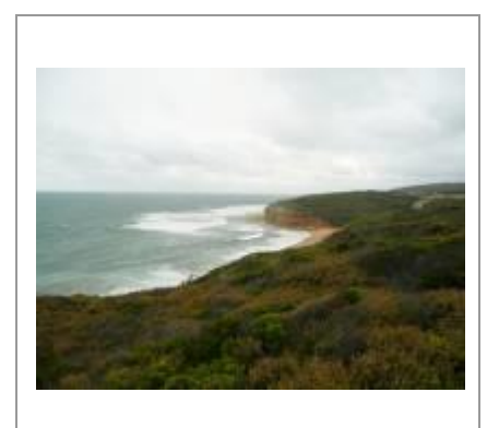
Bells Beach Surfing Recreation Reserve (VHR H2032) is significant for its long and continuous association with the Victorian and Australian surfing community and as the location of the world's longest running surf competition.

The Former Benalla Migrant Camp, Benalla (VHR H2358) was part of the government immigration programme to increase Victoria's population post-WWII. It is of significance for its connection with former residents and their families and for the way that the experiences of post-WWII non-British migrants can be interpreted to the broader Victorian community.