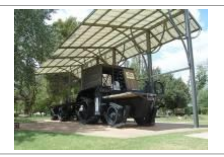
Big Lizzie , Red Cliffs (VHR H1919), is a tractor and two trailers of historical significance for their association with land clearing in the Mallee and Mildura regions for agriculture and the establishment of soldier settlement schemes following World War I.