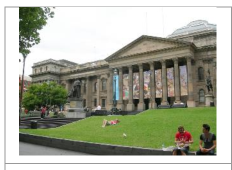
The State Library of Victoria , Melbourne (VHR H1497), is historically significant as the principal educational and cultural centre for the people of Victoria for more than 150 years. The early buildings are significant as the first purpose built, free public library in Australia and one of the first in the world.