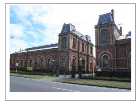
The Sewerage Pumping Station , Spotswood (VHR H1555), is historically significant as the key component of Melbourne's first centralised sewerage system which began operations in 1897. The station is unique in Australia as an intact ensemble of buildings, sewage pumping machinery and objects.