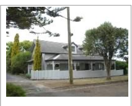
The Portland Inn , Portland (VHR H2071), built c.1841, is significant as one of relatively few surviving pre-1851 structures in Victoria and for its association with the earliest officially sanctioned settlement of Portland, the first permanent post-contact settlement in Victoria.