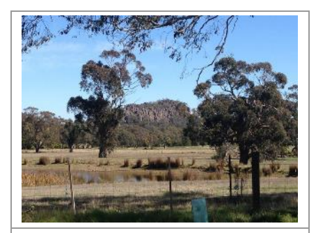
Hanging Rock Reserve, Newham (VHR H2339), is historically significant as an early and popular recreational destination and meeting place for Victorians. Since the 1860s large numbers of visitors have congregated here to be entertained, climb the Hanging Rock formation and participate in outdoor sport and leisure activities, including horse racing.