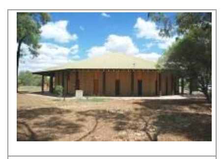
The Bangerang Cultural Centre , Shepparton (VHR H1082) is significant for the important role it has played for Bangerang people in preserving their identity and raising awareness of Indigenous culture more broadly to the Victorian and wider community.

Loong, Chinese Dragon (VHR H2120) is a ceremonial dragon held by the Golden Dragon Museum, Bendigo. It is a rare surviving artefact associated with the Victorian Chinese community's customary and continuing practice of public performances and processions in different parts of the state.