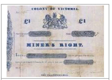
The Miner's Rights Collection , Ballarat (VHR H2112), is a collection of historical significance associated with the Eureka uprising and the subsequent improvement to miner's rights and conditions on the goldfields through the development of an administrative system that remained substantially unchanged from the 1850s to the 1970s.