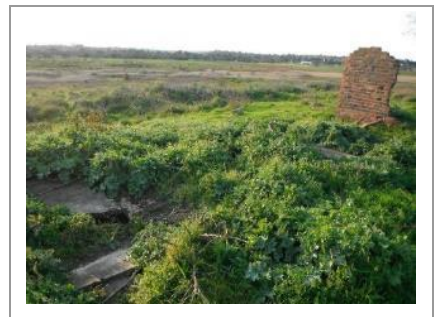
Nerre Nerre Warren , Endeavour Hills (VHR H2348), is significant for its potential to yield information about the first Native Police Corps established in Victoria in 1837, the daily lives of the people in the Westernport District of the Port Phillip Protectorate (1841–43) and the workings of the Horse Stud Depot of the Victoria Police (1853–1931).